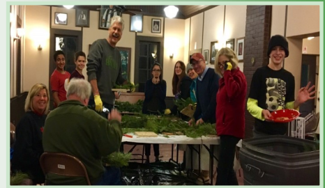
The Youth Group making Advent wreaths