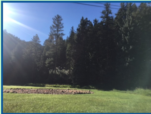
The Labyrinth in the Meadow at the Church of the Transfiguration